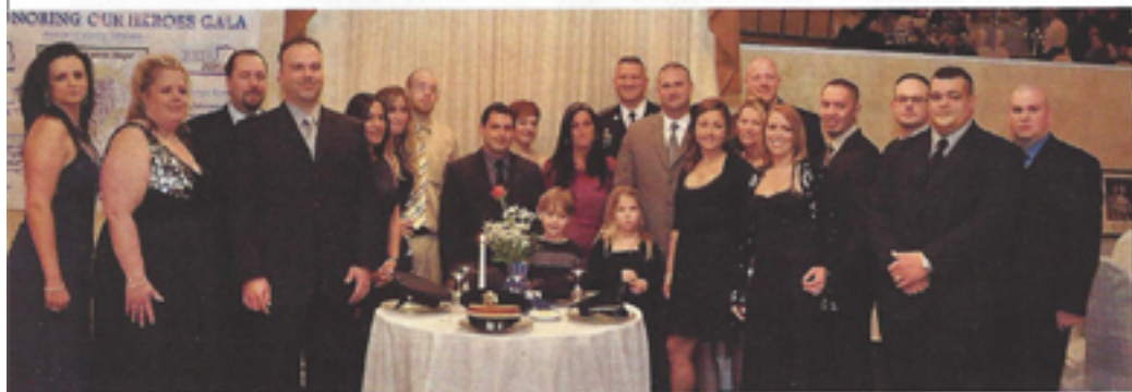
The 2011 recipients and Officer Down Inc. members.