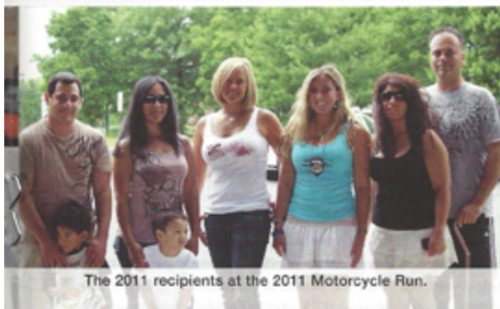
The 2011 recipients at the 2011 Motorcycle Run.